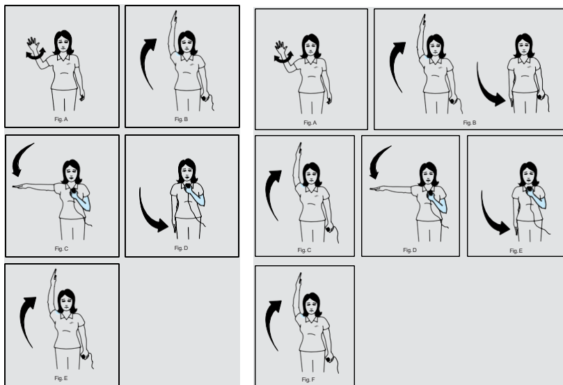
Figure 1. FORWARD START.